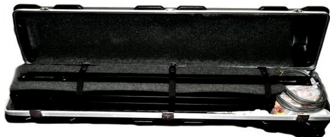
ViewScan Ultralight carrying case

The new ViewScan UltraLite is View's latest and most compact concealed weapons detection model, taking up little space but providing immensely accurate screening. ViewScan is the most technologically advanced walk-through Concealed Weapons Detection System (CWD). It's easy-to-use, PC-based software displays and tracks persons who are carrying threat objects, greatly simplifying the process of discriminating suspicious items from harmless ones. Its highly sensitive, completely passive sensor technology accurately detects the location and number of threat objects such as knives, guns and razor blades. Simultaneously, it ignores personal artifacts like coins, keys and belt buckles. The graphical user interface (GUI) displays an object's location on the image of the scanned person (see screen shots on reverse). ViewScan does not interfere with any medical